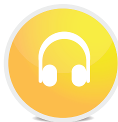
Malaysian Business Radio