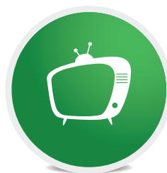
Malaysian Business TV