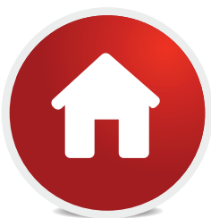
Malaysian Business Event