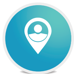
www.malaysian-business.com Online News portal